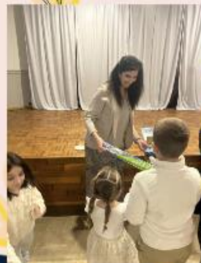
Kathara Deftera Kite Flying event and Luncheon at West Nyack. Ahepa Meteora and new DOP Nikifora chapters hosted. March 17th