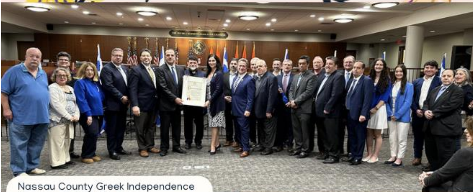
Nassau County Greek Independence Day Flag Raising Ceremony, Proclamation and Dinner Event – Hosted by AHEPA, DOP and Greek Orthodox Churches of Long Island. March 28th