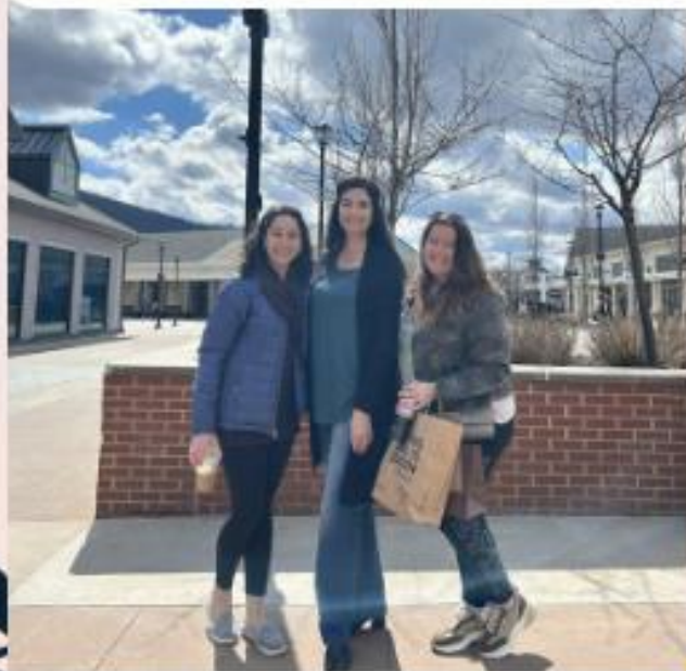
Shopping at Woodbury Commons with Sisters from District 5 New Jersey March 16th