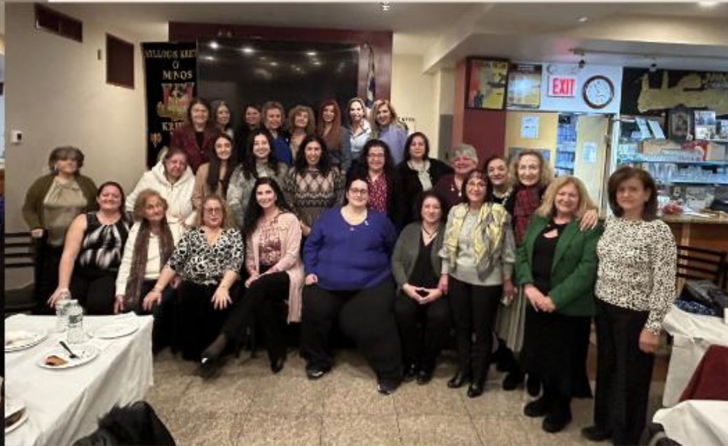
January 6 - Ilion Astoria Vasilopita cutting and meeting - Visitation