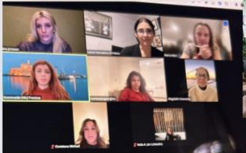
January 14 - Visitation Zoom Evryklea chapter Manhattan