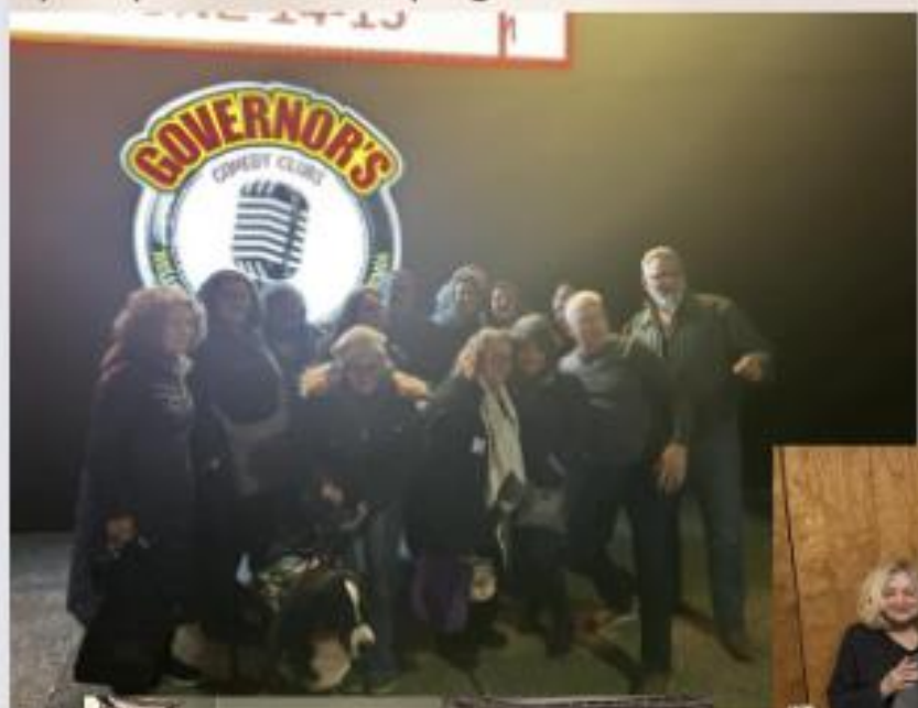
January 14- Iliion Comedy Night Fundraiser -Levittown, N.Y