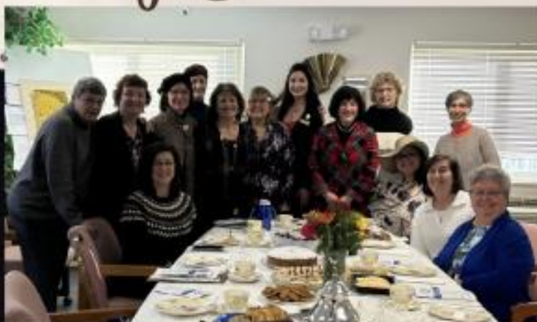
January 21 - Odysseus Chapter Tea Party and Visitation - Rochester, N.Y