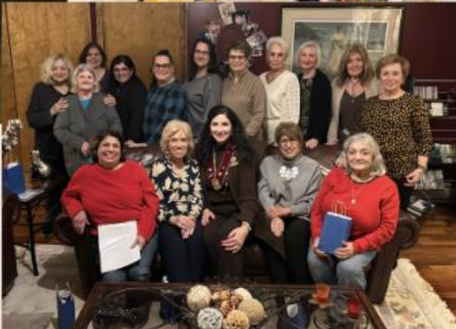
January 25 - Callicolone chapter Visitation , Initiation and Dinner meeting - Staten Island,