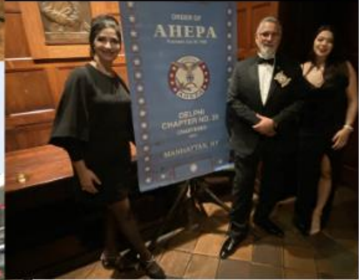
AHEPA Delphi #25 100th Anniversary Gala The Harvard Club New York City November 11th