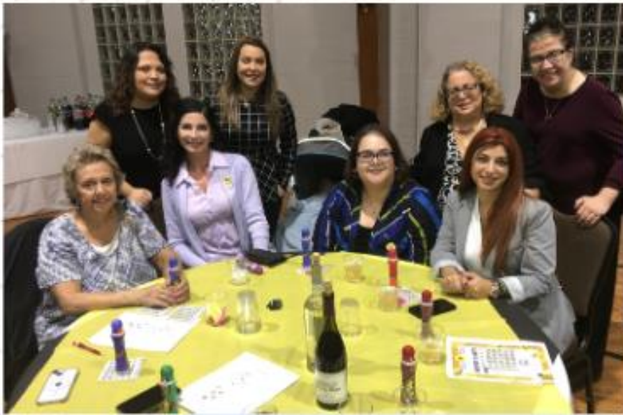
Pasithea Honey Party Hempstead, Long Island November 9th