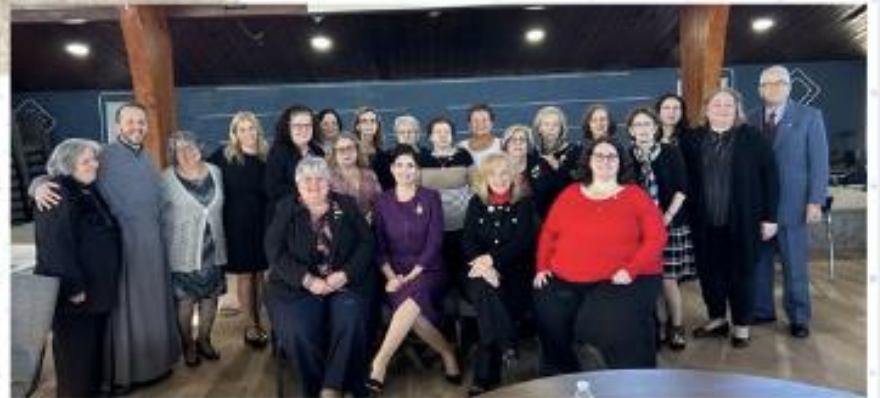
Diocles Founder's Day Luncheon Yonkers November 19th