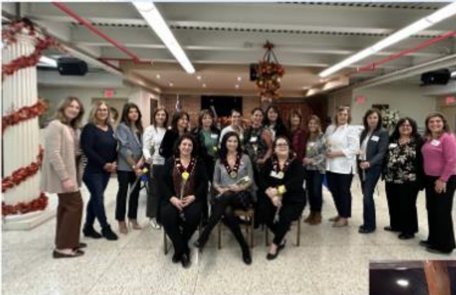
Medusa Founders Day Celebration and Mass Initiation Meeting Merrick, Long Island November 14th